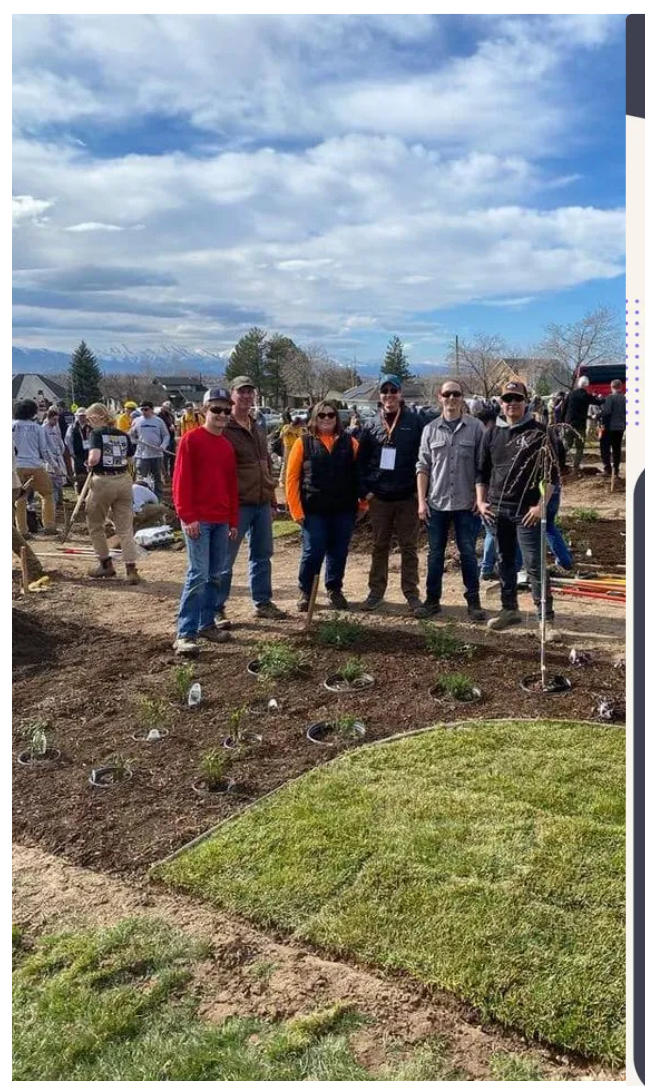
C students traveled to Utah to compete at the National Colle Competition over Spring Break, and won 1st Place in the La Installation Division!