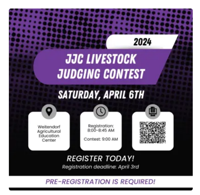
JJC Livestock Judging Contest